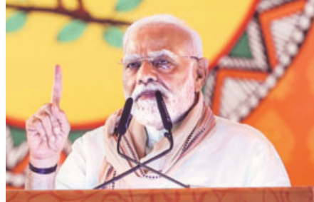
Prime Minister Narendra Modi said his government has delivered on its promise by notifying the setting up of the National Makhana Board in Bihar

Modi, meanwhile, praised the "leadership" of Bihar Chief Minister Nitish Kumar, and spoke of the Centre and state government's women-centric schemes. Since 2010, support of women voters has been crucial to the electoral victories of Kumar-led Janata Dal (United)-Bharatiya Janata Party coalition.