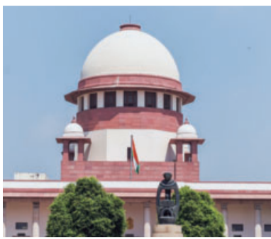
The SC Bench was hearing a plea seeking recall of its order, which had directed the EC to accept Aadhaar as the 12th identity document

The court said it could not give a piece-